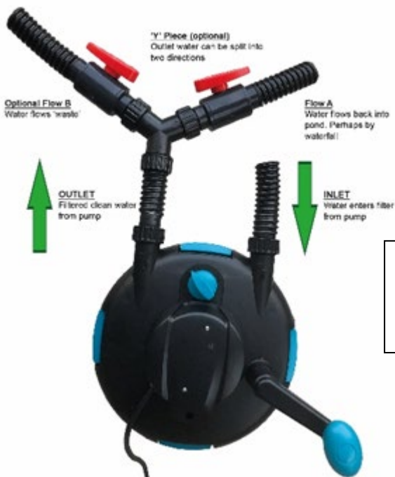
Image showing overview of Filter when a small Y Distributor is attached

Connection of a Y Piece with Taps will save you switching your outlet hose between pond and waste direction. This can be problematic if the water outlet hose isn't easy to move direction as you have to switch between 'waste' hose and 'pond' hose. The outlet flow can be directed in two directions – one permanently to waste, one back to the pond. You simply have to turn the Y Piece taps on/off at the appropriate time.