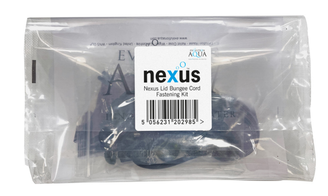
Nexus Lid - Bungee Cord Fastening Kit (For All Nexus Lids) (EA CODE: NXLIDKIT)