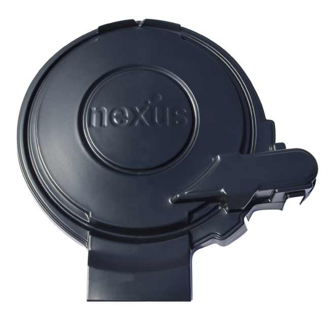
Fits Nexus 210 Style (Nexus 210 / 220 / 220+) (EA CODE: LID200)