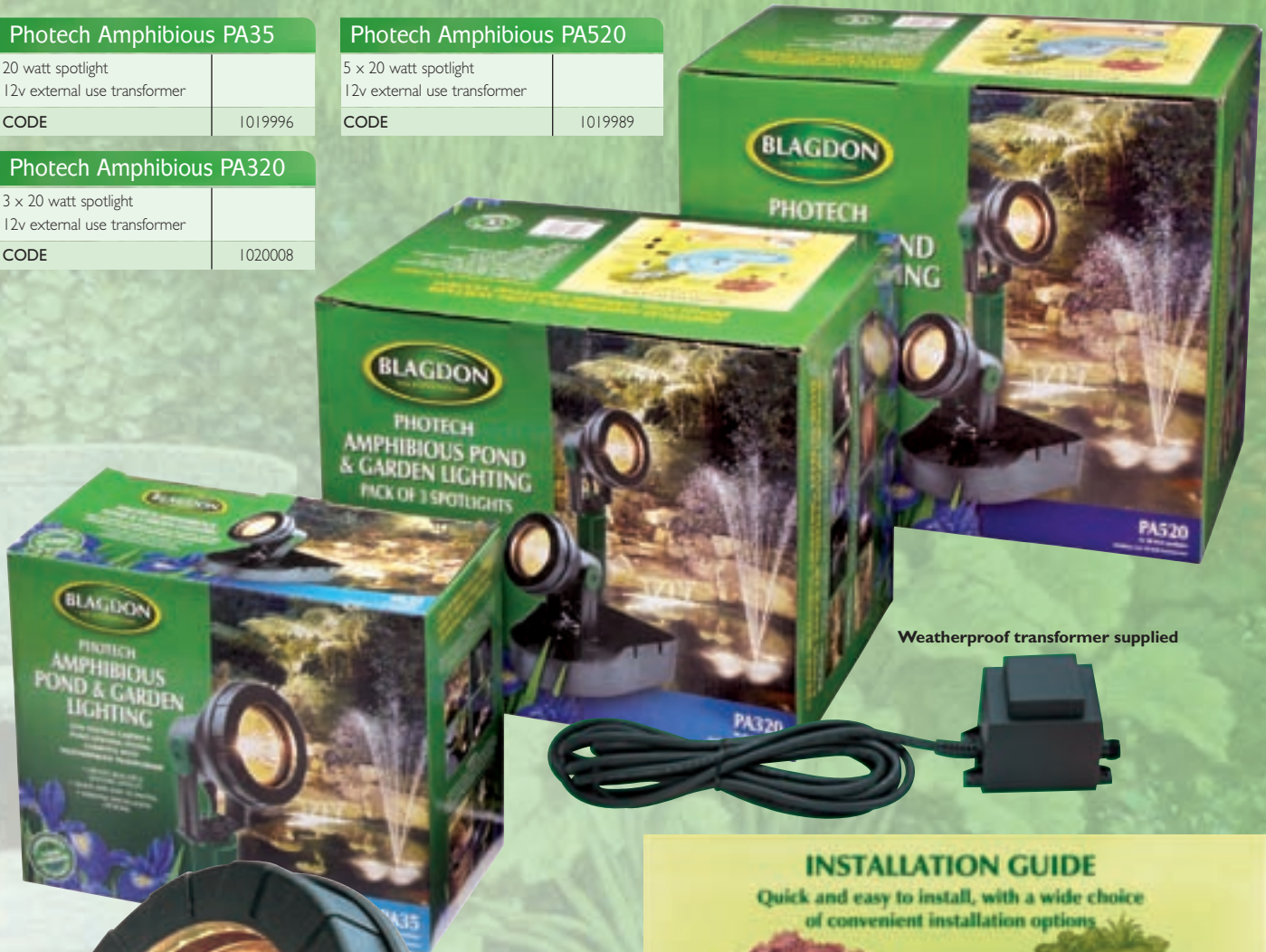
Weatherproof transformer supplied