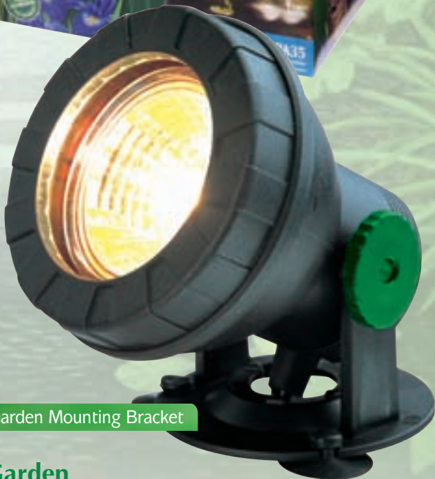
Garden Mounting Bracket